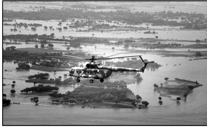
A Pakistan Army Mil helicopter flies over flooded areas of Jampur near Dera Ghazi Khan, Pakistan, on Thursday, Aug. 19, 2010.

The report also noted: “Leptospirosis ... a zoonotic bacterial disease that is transmitted through contact of the skin and mucous membranes with water, damp vegetation, or mud contaminated with rodent urine. Infected rodents shed large amounts of leptospires in their urine. Flooding facilitates the spread of the organism due to the proliferation of rodents and the proximity of rodents to humans on shared high ground. Outbreaks of leptospirosis oc-