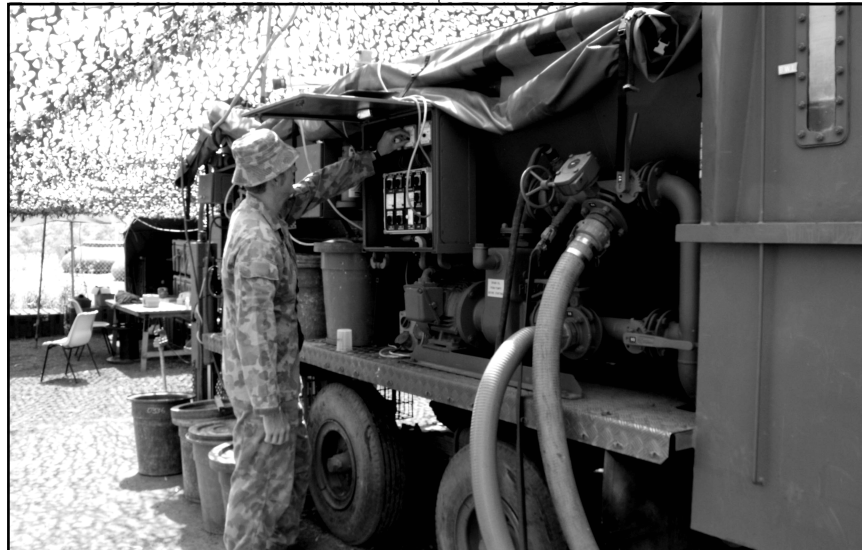
The hard way: An Australian Army sapper from the 3rd Combat Engineer Regt. operates a truck-mounted water purification unit in Afghanistan. Earlier-generation water purification plants have depended heavily on diesel power, chemicals, and regular filter changes, adding to the logistical burden in deployment and sustained operations. They have not been designed as relatively maintenance-free “leave behind” units which could bolster civil-military relations and minimize the need for external support for remote villagers.

“leave behind” for a village when the relief forces depart, ensuring a long-term positive benefit for remote rural areas which may have had far less desirable water supply options even before the disaster.