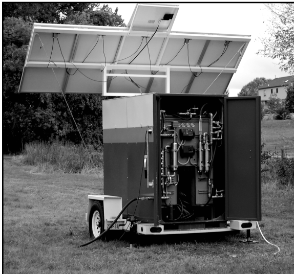
IWC's trailered water purification unit: Finally, a deployable system which does not depend on diesel, or filters, or chemicals. The unit can stand alone in the field for years without spares, and pump out up to 30,000 US gallons a day of potable water. It was designed to be fully "soldier-proof" and can generate additional electricity to power sat-phones or laptops.

sponse. Moreover, as a number of senior military officials have indicated privately, the Armed Forces are too busy facing an existential struggle for the nation by suppressing dissident activities — particularly spilling back into Pakistan from Afghanistan — to consider taking power again.